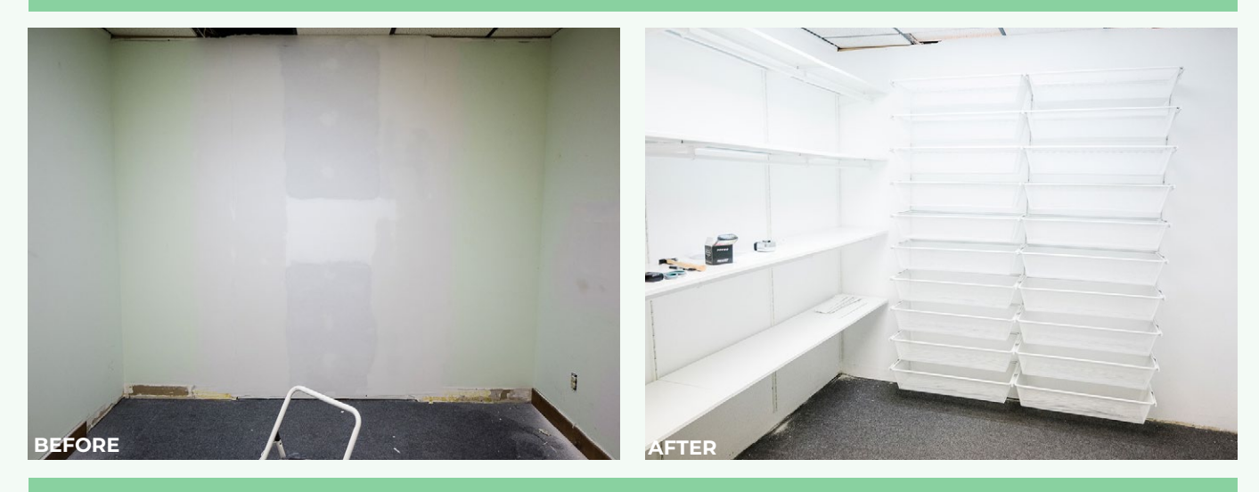
Supply closet | We have moved and updated the material services space – leveraging our expansion into Suite A and allowing for better efficiency.

Conference Room | Walls have been knocked down and a new hallway has been added to connect the suites together for quick and easy access. This is one of the rooms that will be getting new carpet!